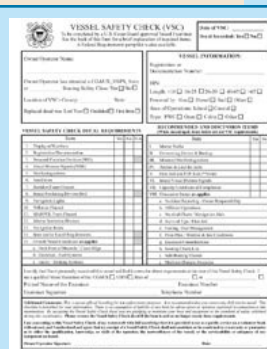
Copy of the Vessel Safety Exam forms used by the Auxiliary.