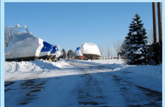
During the Boat Show, it was beginning to feel like spring.....until mother nature reminded us who's boss.