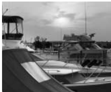
Sunset over Belle Maer Harbor after a safe day of boating with family and friends .